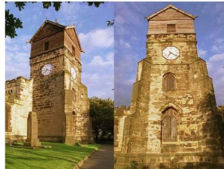
St Leonard's Church, Middleton